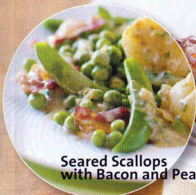
Seared Scallops with Bacon and Peas