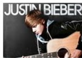
Review: New Justin Bieber album