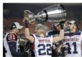
Look back at Grey Cup 2010