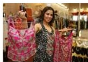
Special section: Small business